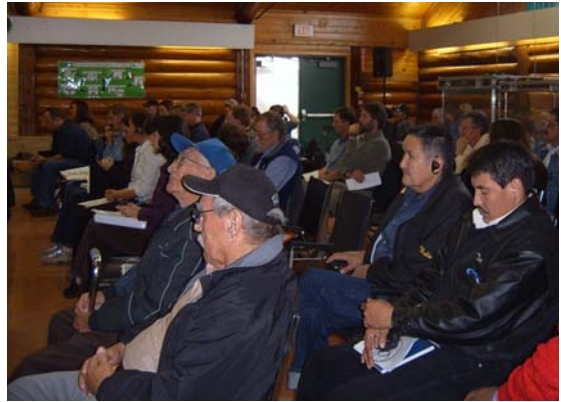
The Review Board recently travelled to Fort Resolution to hold a public hearing on the Tamerlane Pine Point Project.

The Review Board is currently drafting its Report of Environmental Assessment for the environmental assessment of this mineral exploration program.